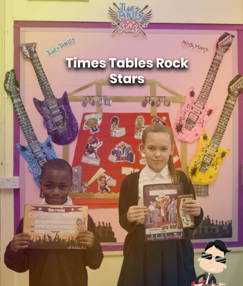
Times Tables Rock Stars