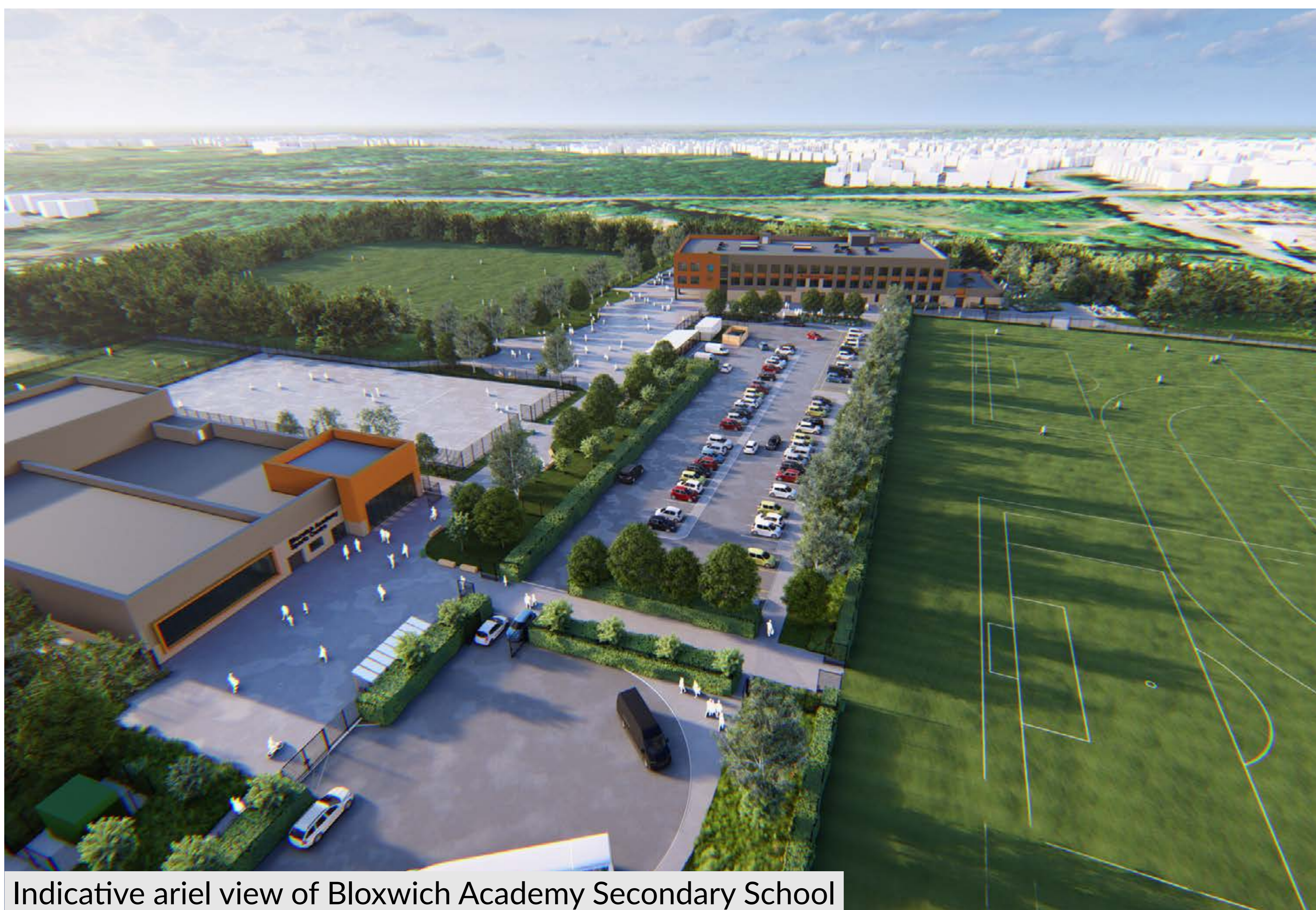
Indicative ariel view of Bloxwich Academy Secondary School