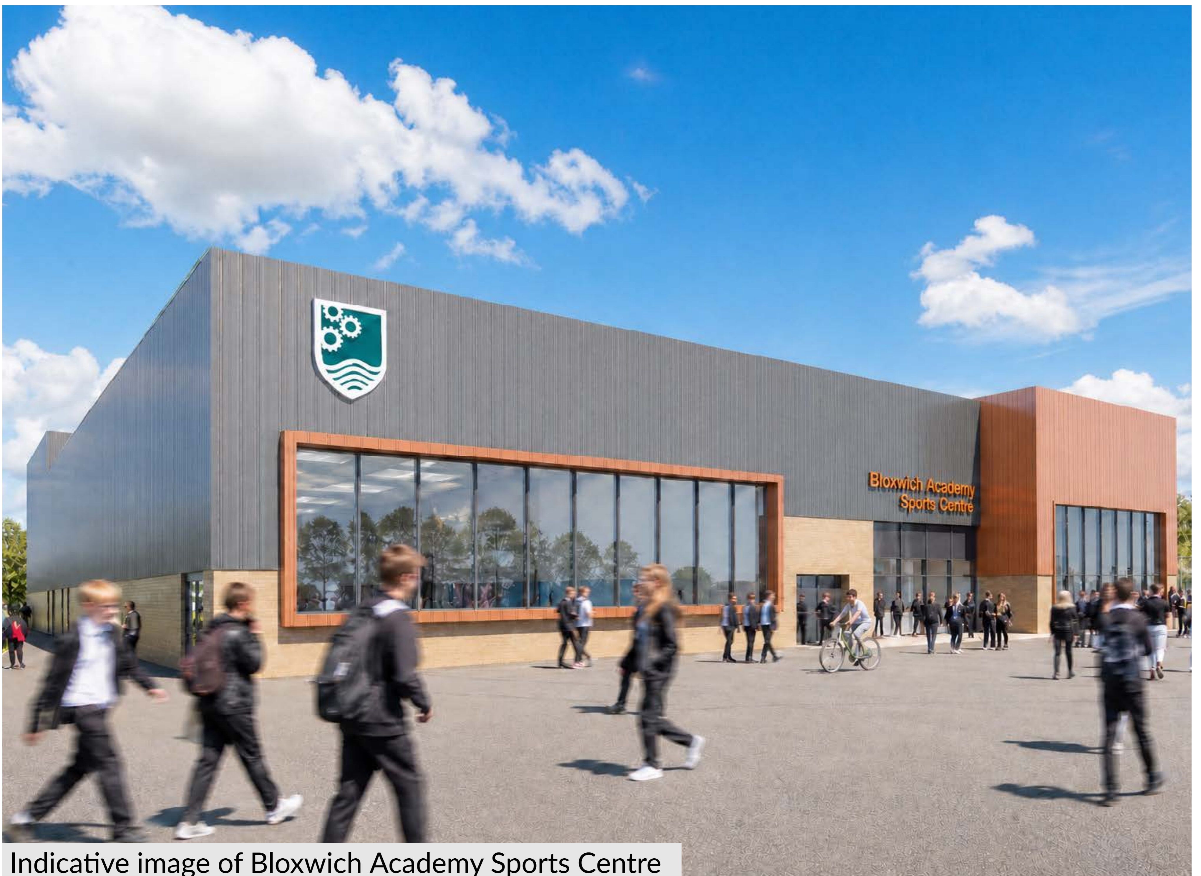
Indicative image of Bloxwich Academy Sports Centre