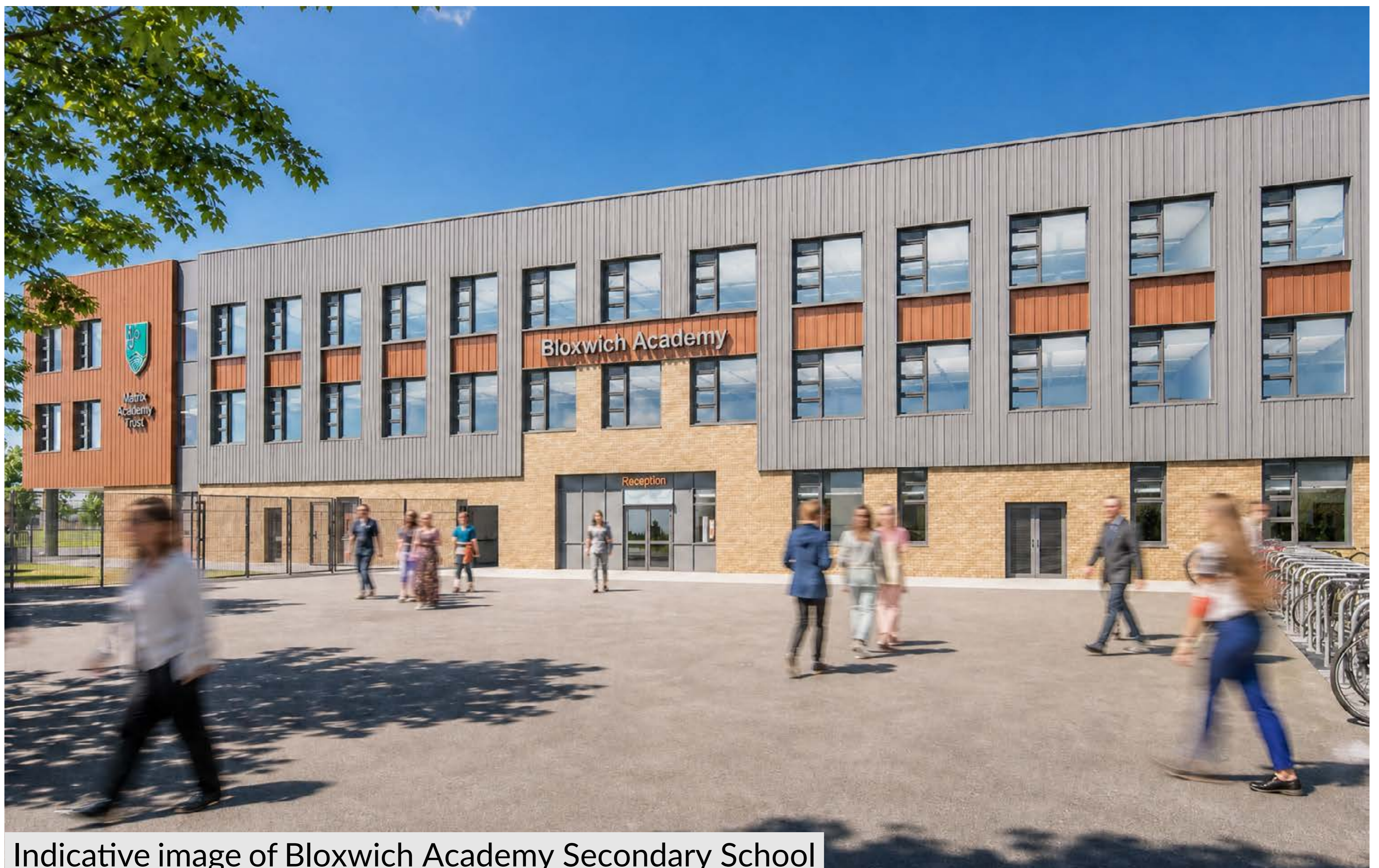
Indicative image of Bloxwich Academy Secondary School