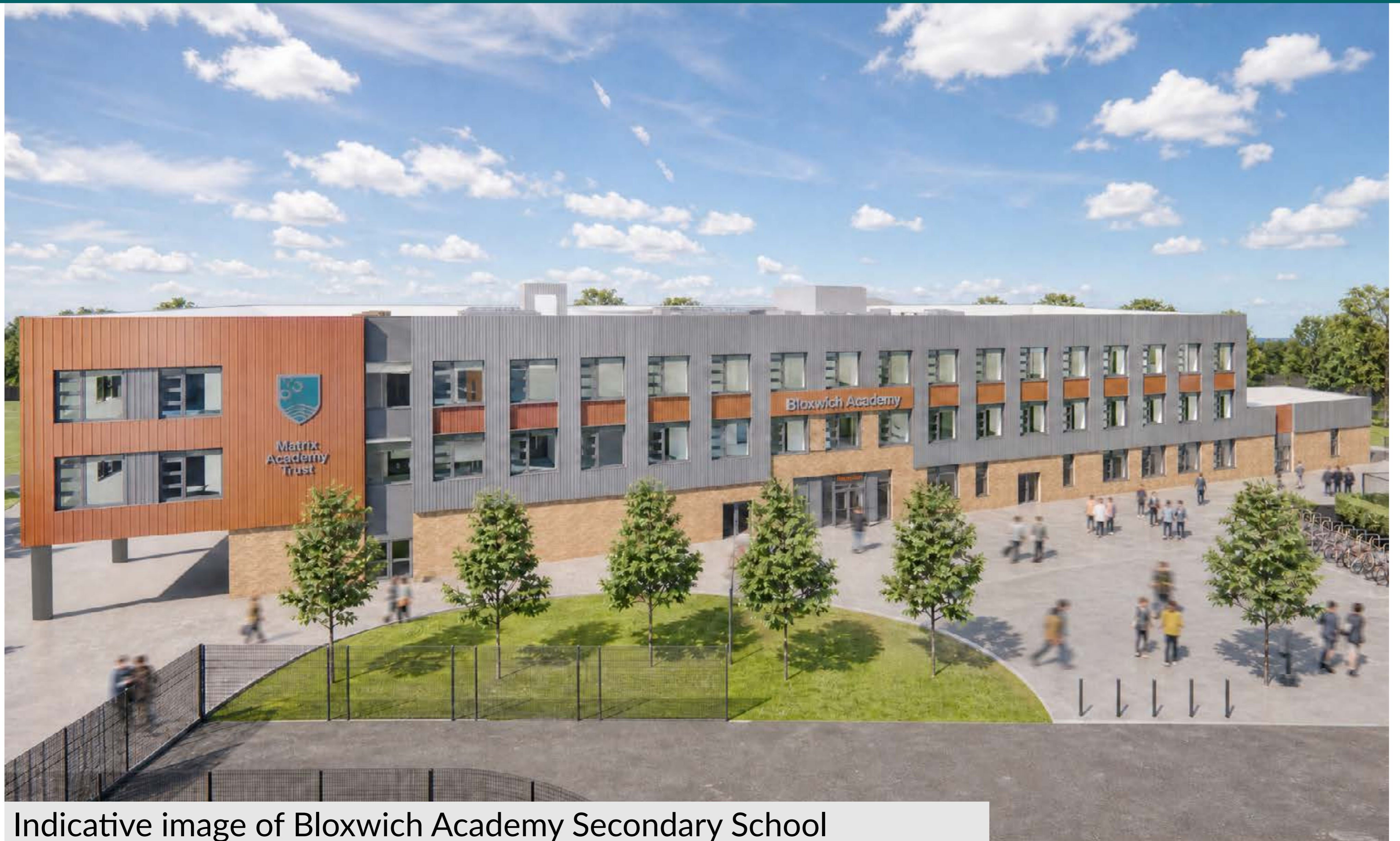
Indicative image of Bloxwich Academy Secondary School

Your feedback is important and will help shape the final proposals submitted.