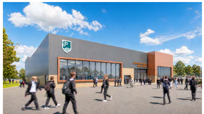
Indicative image of the proposals Sports Centre

The development will retain key habitat areas, introduce new planting and follow best practice to safeguard wildlife. As part of the wider project works, advice from Natural England and ecological experts is being sought to help ensure that biodiversity is not only protected but enhanced throughout the development of the new secondary school.