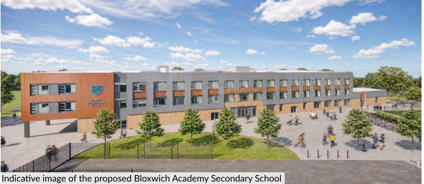
Indicative image of the proposed Bloxwich Academy Secondary School

Kier is bringing forward proposals on behalf of the Department for Education (DfE) for the redevelopment of Bloxwich Academy Secondary School. These proposals aim to deliver a modern, high-quality, secure and sustainable learning environment for pupils, staff and the wider community. The development of the school will involve relocating the building within the site, improving access and safeguarding, while enhancing outdoor learning and play spaces.